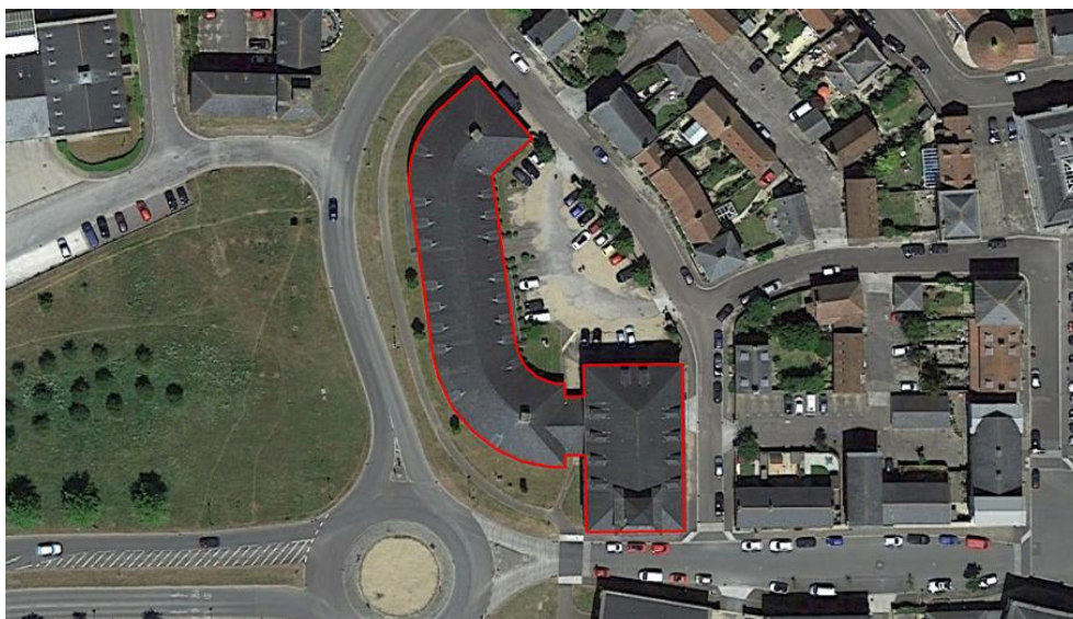
Google Aerial View