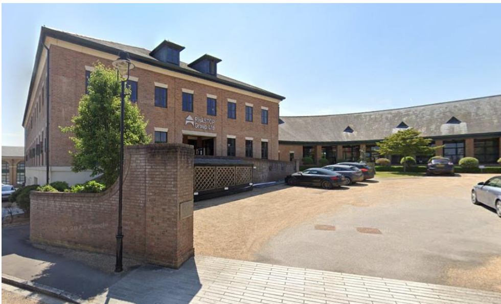
Google Street View