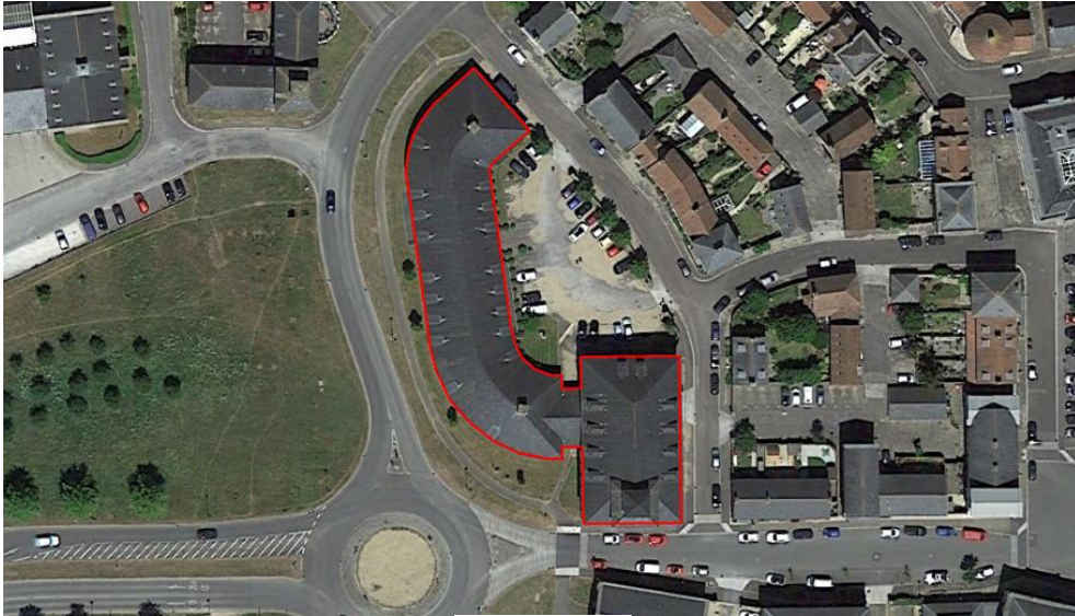
Google Aerial View